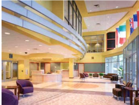
EMC 2 Lobby

Behavior and dress expectation for subcontractors may be different in an operating environment, driven by policies the client has for its own employees.