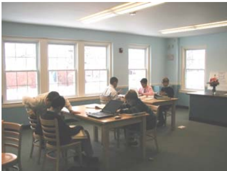
Hillside School Library

Renovations in occupied space can be done successfully without driving the client crazy. Thorough pre-planning coupled with open communication and proven management controls will support a process that ensures minimal disruption.