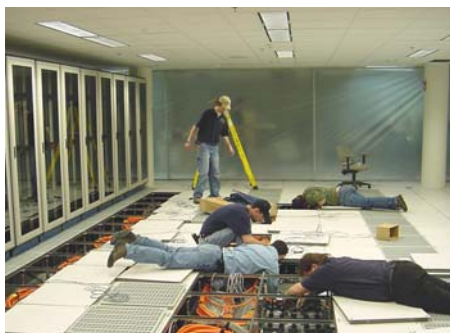
EMC 2 Datacenter