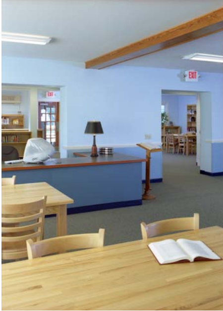
Hillside School Library

and avoid adversarial relationships. This Super will appreciate the importance of maintaining production or operations throughout the construction period and will find the best solutions to keeping the program on track.