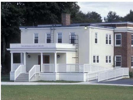
Hillside School Library